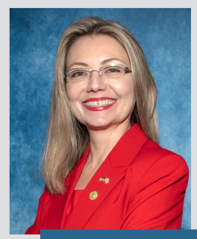
Larisa Svechin Mayor

It is important for each of us to stand up for our principles and support what we value. As a country and a city, we revere democracy, freedom of religion, the value of the First Amendment, and the United States Constitution. As citizens, we support all that proliferates these values. It is time to take a stand. We are at a crossroads in history, a time which will be documented and later studied by students in grade school.